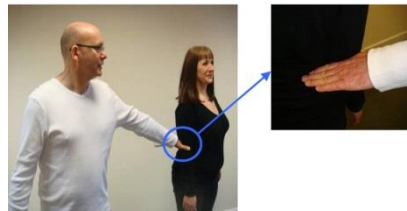
Open Mitten Guide