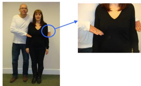
Open Mitten Escort