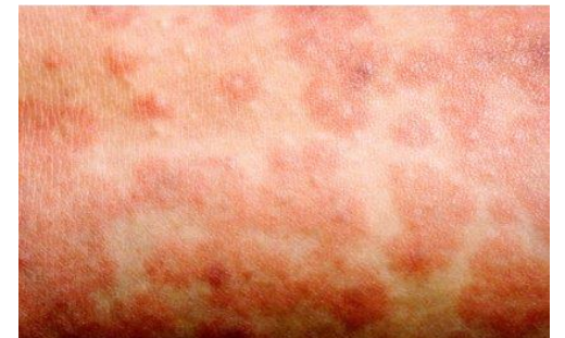
Examples of measles rash from NHS England 2026