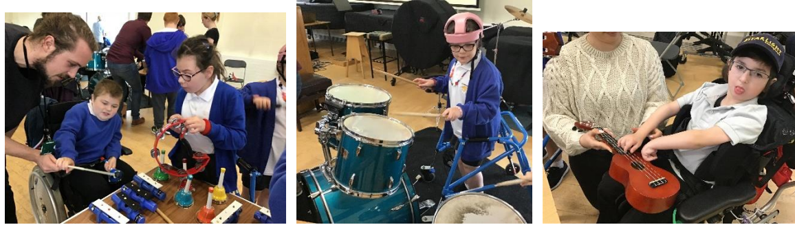
Elm Class: Can you guess who is who?